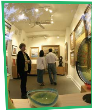
Short North Arts District

Downtown Columbus is filled with entertainment districts, packed with shopping, dining and other attractions. The Arena District is home to many restaurants and nightclubs. Restaurants and cafes line The Cap at Union Station , which connects downtown to the Short North Arts District , home to restaurants, galleries, unique shops and nightclubs. South of downtown are German Village , a restored historic district filled with charming homes and shops, and the Brewery District entertainment area.